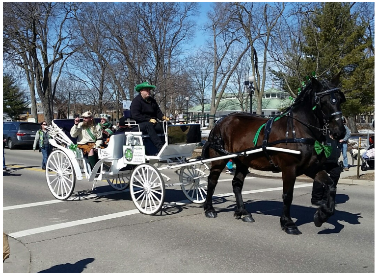
Even the horse and carriage were decorated for the parade.