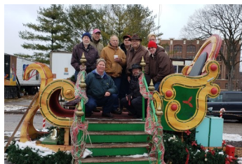
Santa doesn't have enough coal for this crew.

The Riverland Amateur Radio Club is one of these groups that volunteer to help keep the lights up and glowing.